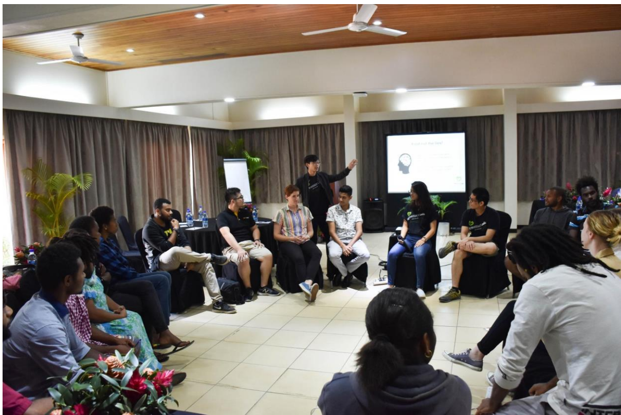
The youth participants were introducing themselves to each other.