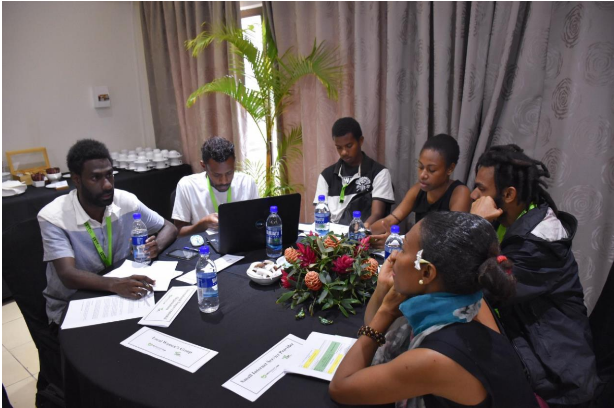
Participants were preparing for the roleplay discussion.