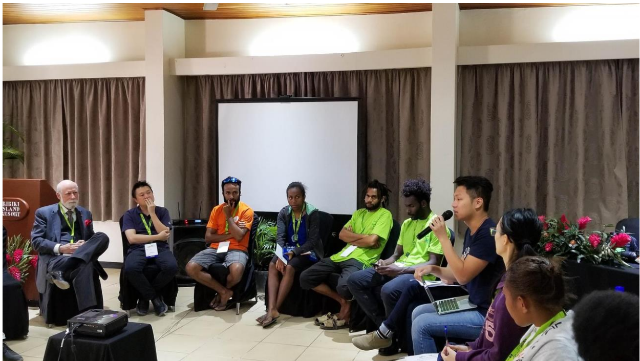
Lightning talk with Mr. Vint Cerf.