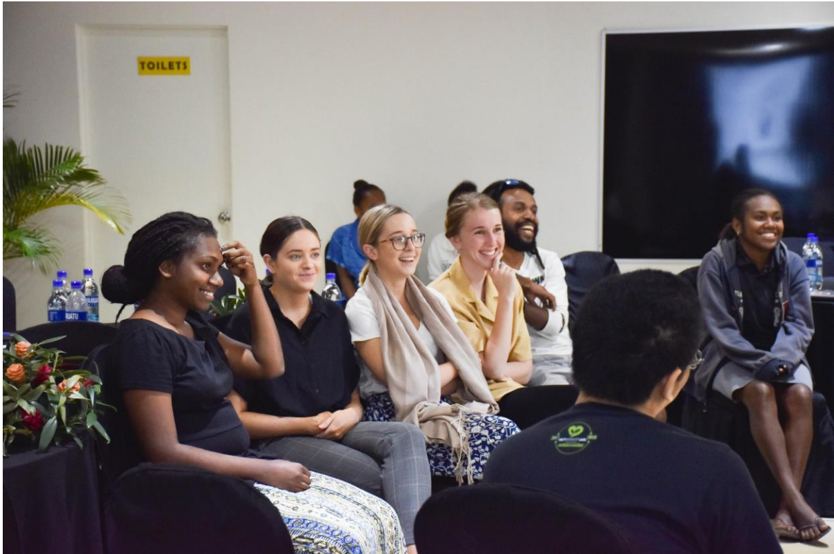
Kickstart our yIGF with various ice-breaking games.