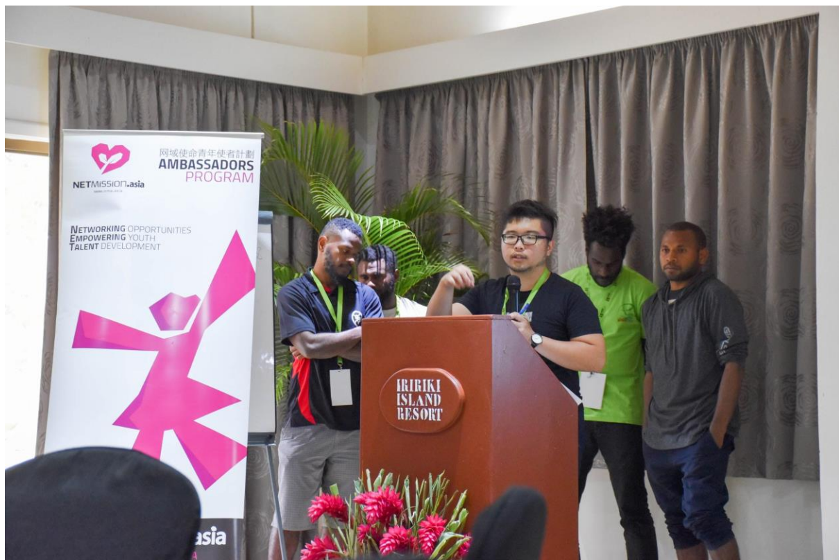
Youth participants were presenting their ideas discussed after the mini-townhall session.