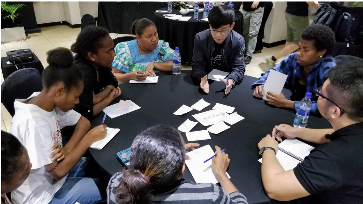
Participants were exchanging their ideas in the idea wall session.