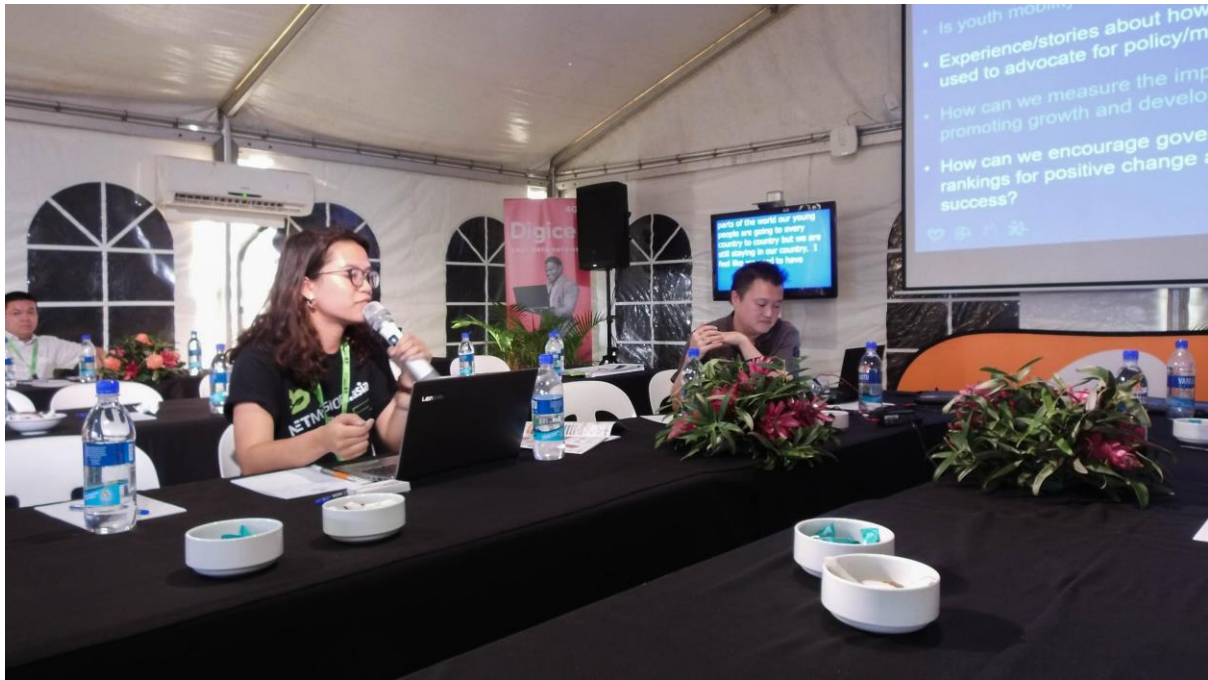
Our NetMission Ambassador was participating in the YMI workshops in APriGF.