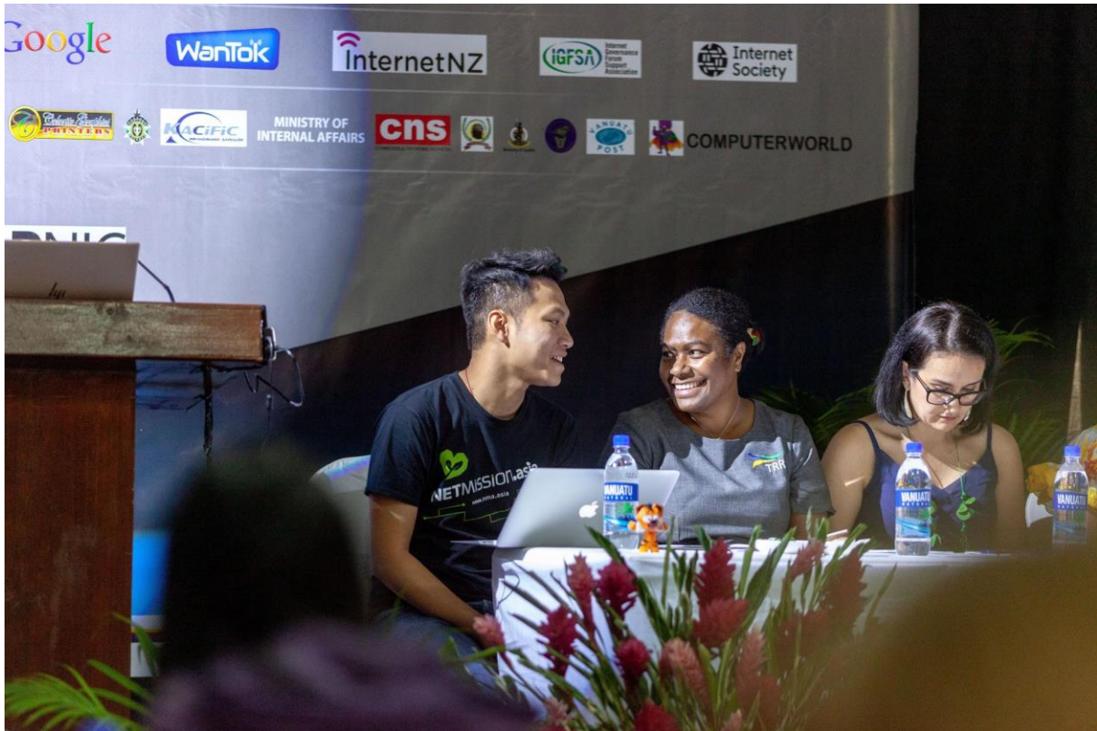
NetMission Ambassador was sharing his journey on Internet governance in APriGF.