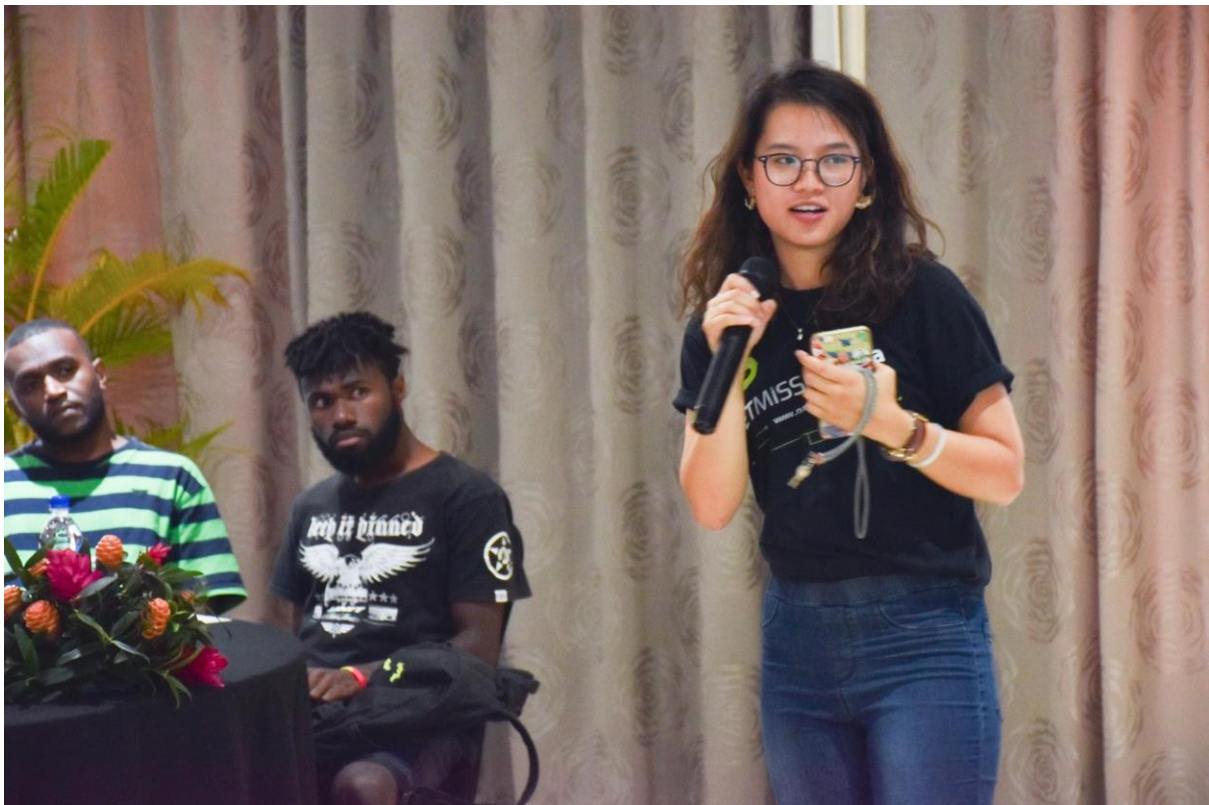
Our organising committee was discussing how we can contribute in the synthesis document with our youth participants.