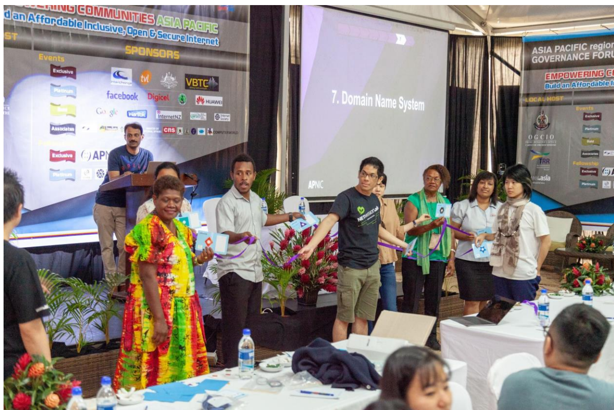
NetMission Ambassadors were also joining the Capacity Building Day.