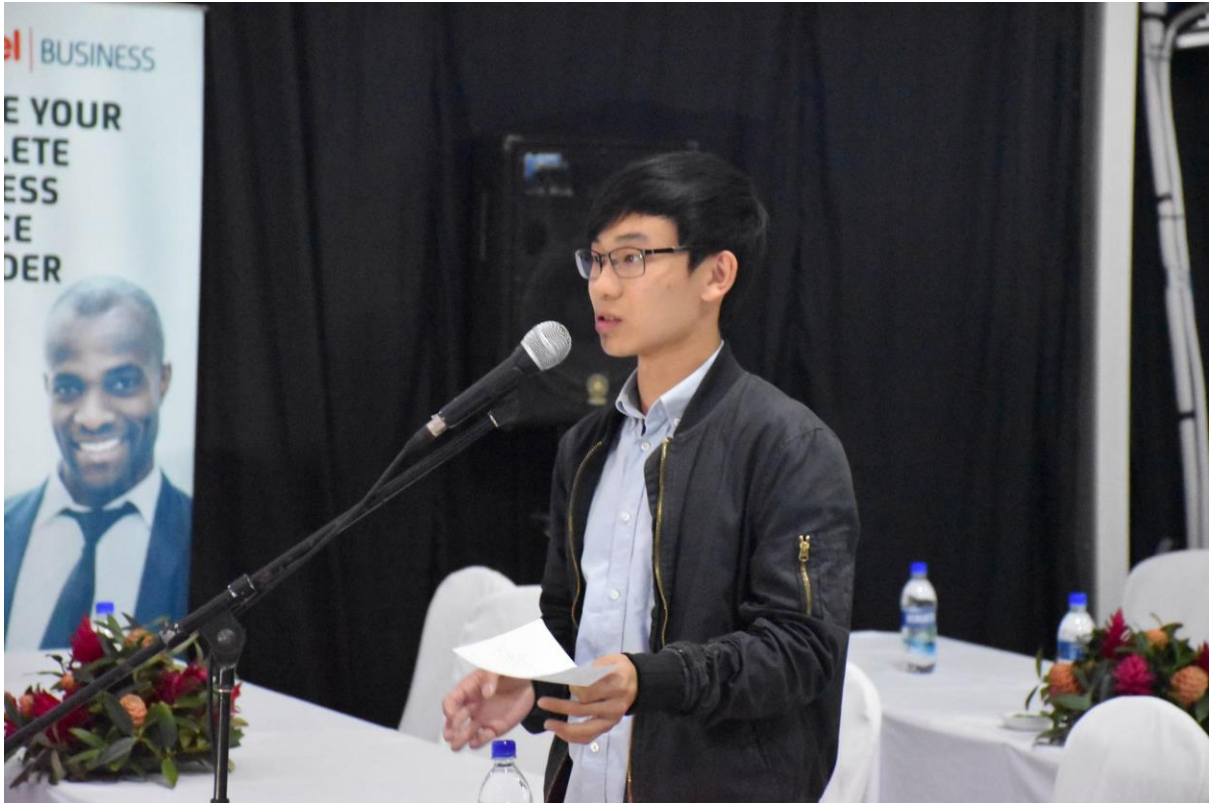
Youth participating in the Townhall session in APriGF.