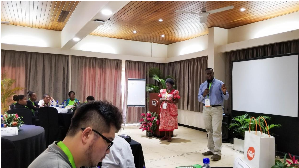
Our honourable guests were sharing their experiences and insights with the participants before the roleplay discussion begins.