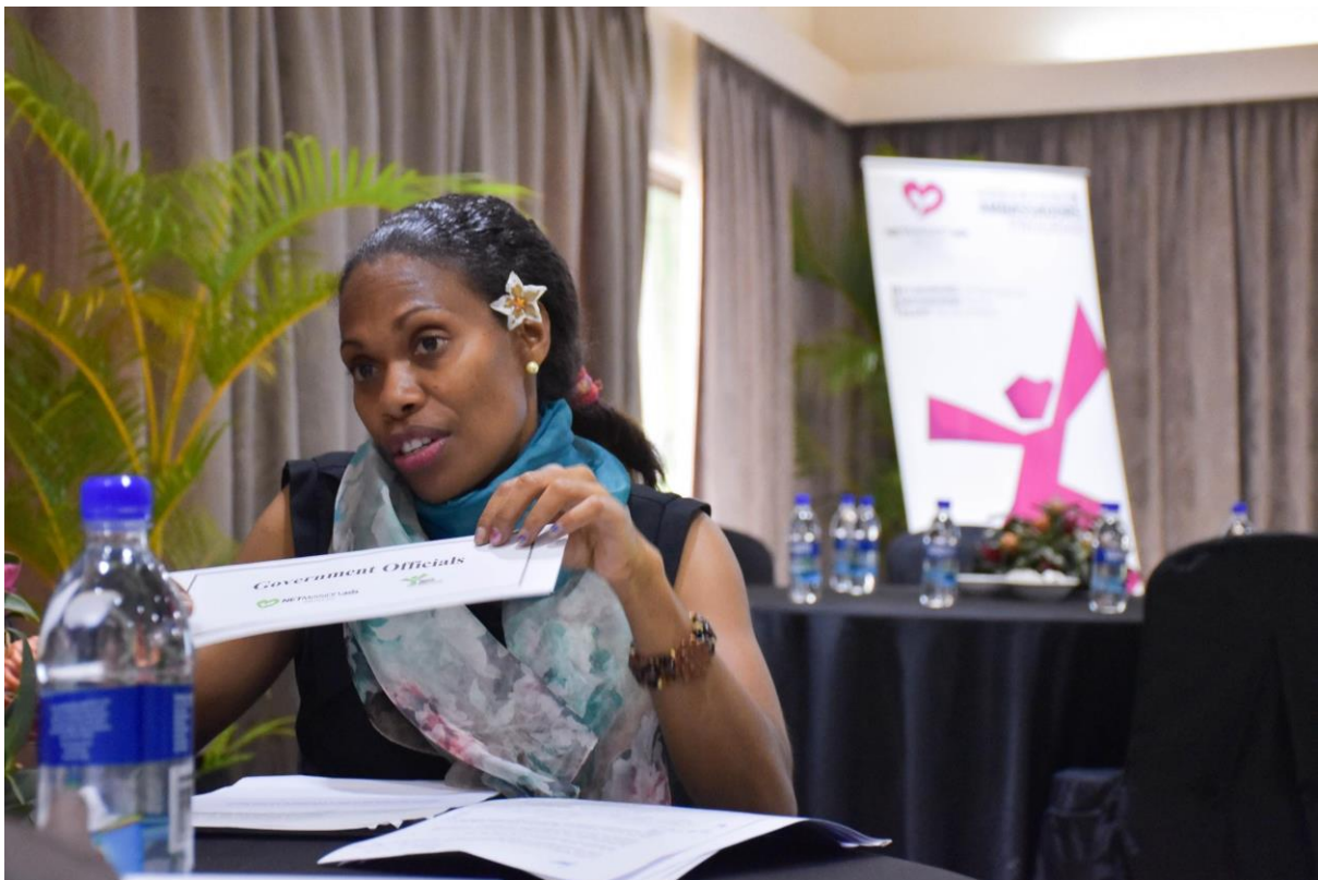
Participants were actively voicing out their opinions in the roleplay discussion.